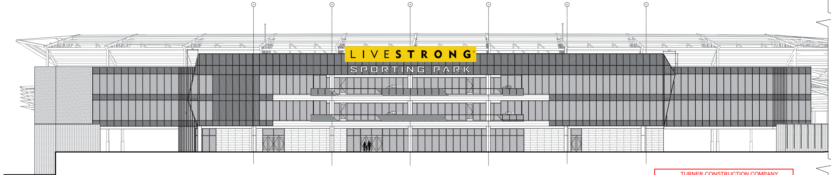
A A.01 - Main ID - West Elevation View SCALE : 1/32" = 1' - 0'

TURNER CONSTRUCTION COMPANY Reviewed for General Acceptance only. This review does Not relieve the subcontractor of the responsibility for making the work conform to the requirements of the contract. The subcontractor is responsible for all dimensions, correct fabrication and accurate fit with the work of other trades. SUBMITTAL #0705-10 14 25-01 BY: Martha Leahy DATE: 04/25/2011