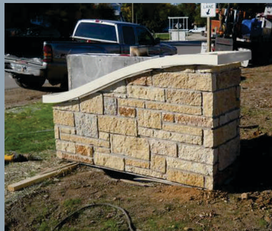
Mercy Medical Center, Lake Geneva, WI Design: Stratident ~ Architect: Ellerbee Becket (now aecom)