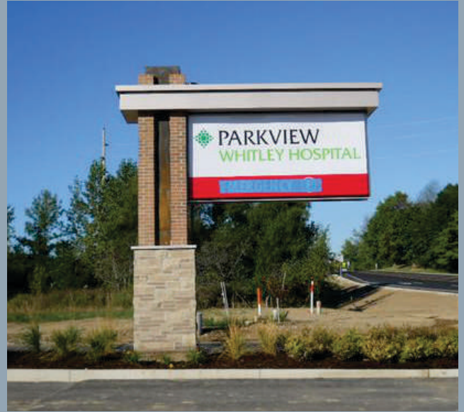
Parkview Whitley Memorial Hospital ~ Columbia City, IN Design: FMG Design ~ Architect: RTKL Associates