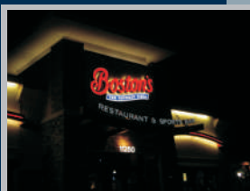
Backlit & Frontlit