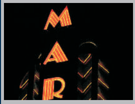
Neon -Channel Outline